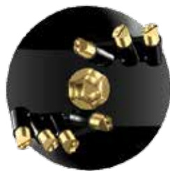
Tapered Tooth Auger (TT)